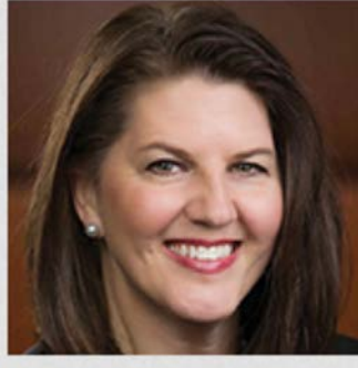
Hon. Madeleine C. Wanslee U.S. Bankruptcy Court (D. AZ) (Phoenix, AZ)