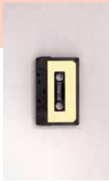
GENERATION X 1966 - 1980