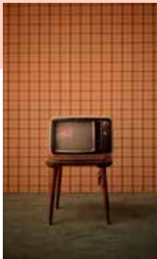
BABY BOOMERS 1942 - 1965