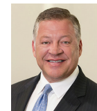
Rep. Bill Shuster Squire Patton Boggs Washington DC