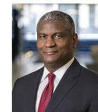
Sec. Rodney Slater Squire Patton Boggs Washington DC