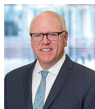
Rep. Joseph Crowley Squire Patton Boggs Washington DC