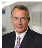
Hon. John Boehner Squire Patton Boggs Washington DC